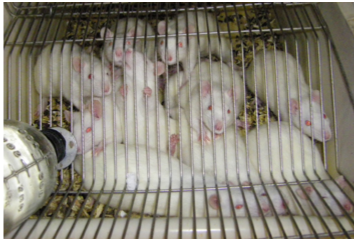
Humans are not 75 kg rats

regulation. During the course of evolution, there have been drastic changes and adjustments in this regard. Which genes are activated or not, or how they influence each other is very different between humans and animals. (9)