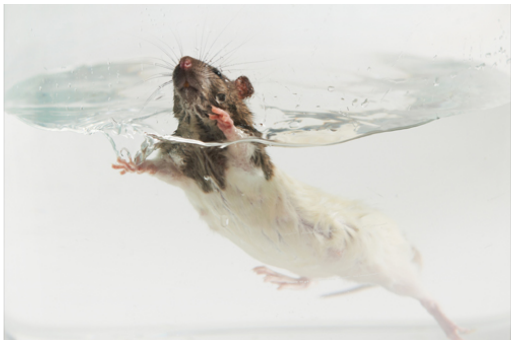
Rat in forced swim test

Many animal experiments are conducted only to develop such animal models. Subsequently, drugs or other forms of therapy are tested on these animal models. If the symptom disappears, it is assumed that a remedy has been found for the disease in humans. The